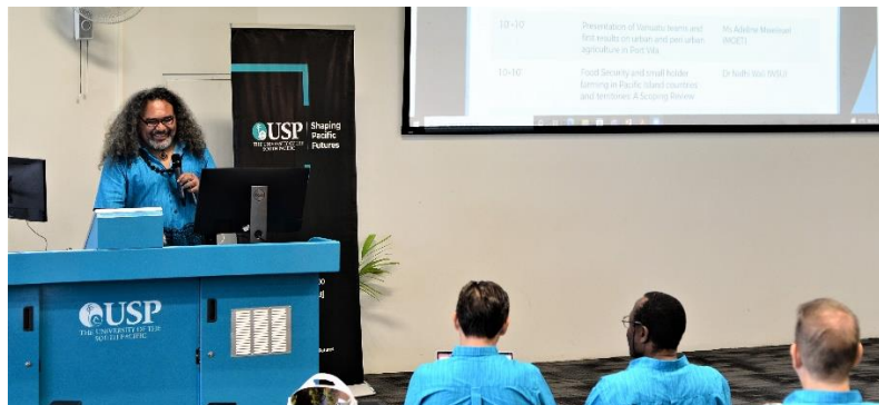
Photo 6 : Explanation of lifestyle and health in the Pacific islands