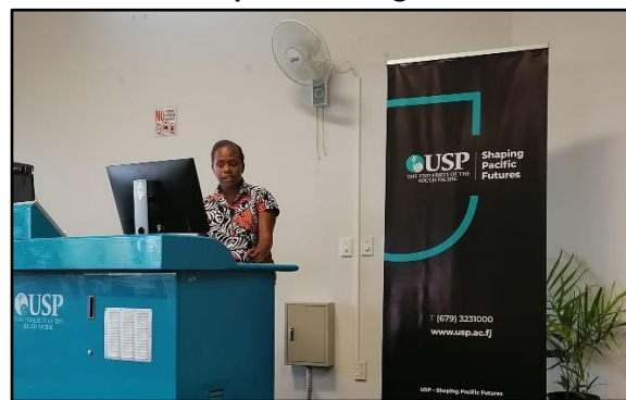
Photo 9: First results on urban and peri urban agriculture in Port Vila