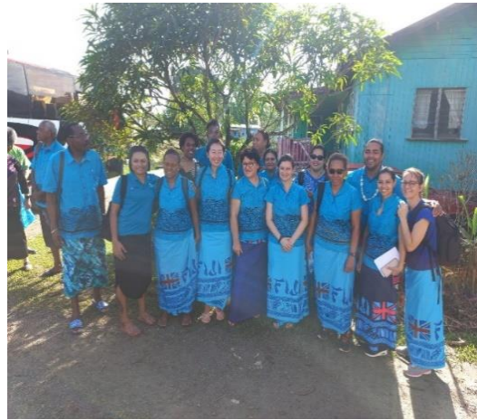
Figure 4: L-R Top/Bottom: Photos from the community visit on day 3 of the workshop.