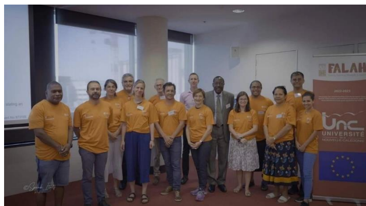
Figure 3: FALAH Teams at the UNSW-UOW Workshop

The workshop closed with a summary of the progress made during the two days of work. These advances made it possible to define the broad outlines of the program of workshops at the Solomon Islands National University which will be held from May 14 to 16, 2024, the University of the South Pacific which will take place from October 22 to 24, 2024 as well as the final conference at the University of New-Caledonia scheduled for March 18, 19 and 20, 2025.