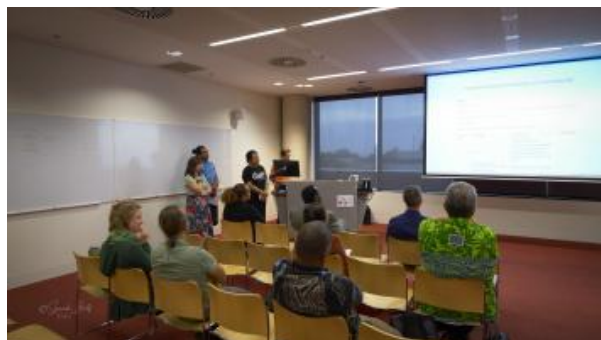
Figure 13 and 14: Preparation of the conference and restitutions at the end of Day 2