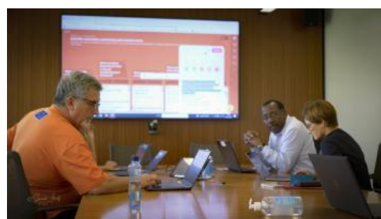
Figures 7 and 8: Groups at work on the different thematic