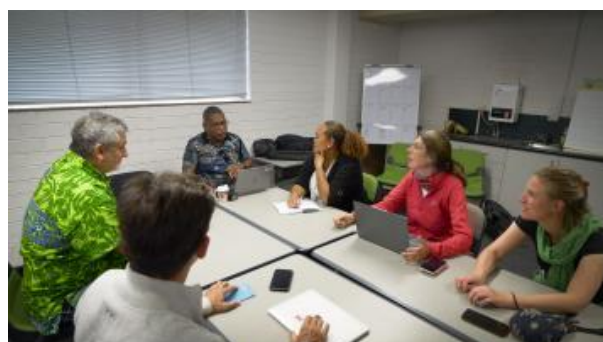
Figure 12: Working with the USP team