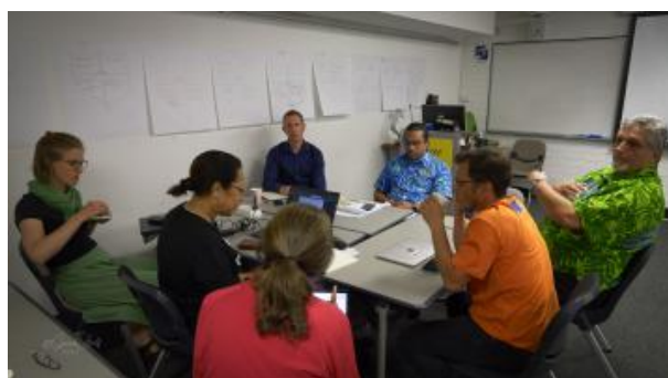
Figure 11: Working with the SINU team