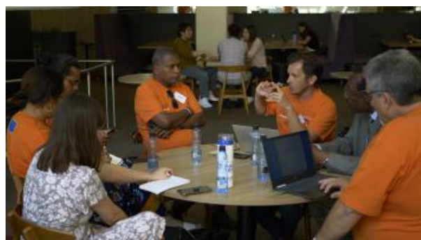
Figure 10: Working in teams